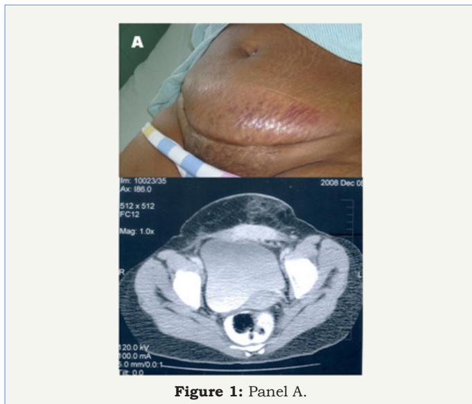
Figure 1: Panel A.

heavy pain in right-low abdomen was asked to hold up her pending abdomen for 10min. Then thermograms of the abdomino-pelvic wall were taken by using an E-25 digital infrared video camera (sensitivity at 0.2 °C; Flir Systems with data analyzing software Quick View 2) positioned at a 1.5m far from the pelvis which provides the thermo pictures and reads the temperatures without touching the subject. All the data were collected in a computer. A hot area (Ar1 - white colored with black dots) showing temperatures from 34.0 °C to 35.4 °C, was spotted on the skin over the right inguinal ligament, and considered hyperthermic, when compared to the same opposite region, used as control, showing temperatures from 32.4 °C-33.7 °C (Figure 2). Thermographic studies use the ipsilateral parts of the body scanning as self-control, as well as the sudden variations of temperature ( \pm 0.6 °C) to determine hyperthermic or hypothermic areas. These temperatures gradients are out of our skin heat perception and Thermographic scanning made it possible to find the hyperthermia area.